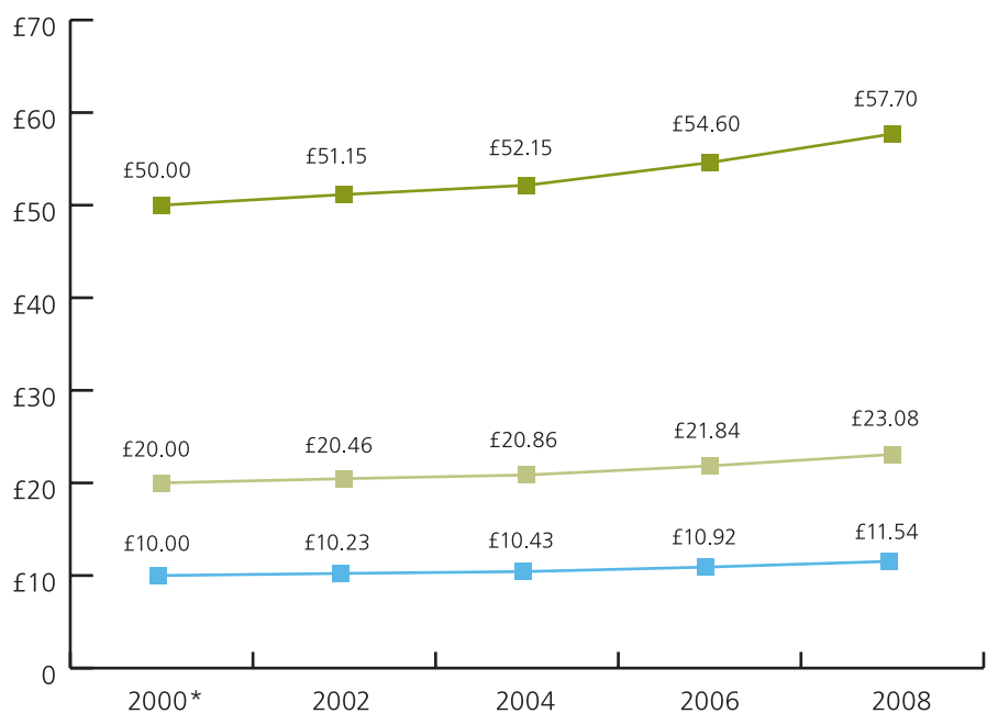
Figure 2 The change required in the value of a donation to keep pace with CPI inflation, 2000–2008

To keep pace with inflation, the savvy donor would need to donate £11.54 in 2008 for it to have the same value as £10 donated in 2000 (see Figure 2). For a £50 donation the increase is even greater: a donor would need to give £57.70.